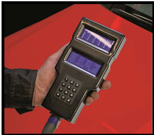
Select-A-Map Programming Handset