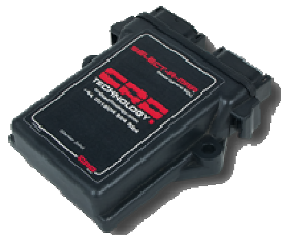
Select-A-Map Diesel Control ECU